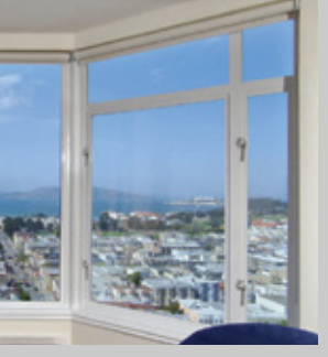
COMING SOON PACIFIC HEIGHTS

SOLD RUSSIAN HILL (Single-Family Residence) Offered at $5,450,000 Represented Seller & Buyer