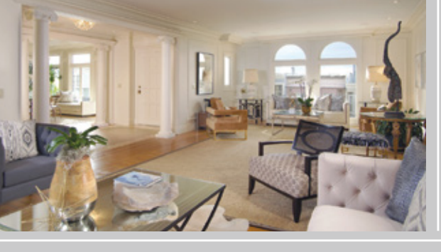
SOLD EMBARCADERO (Condominium) Offered at $1,885,000 Represented Seller

SOLD RUSSIAN HILL (Single-Family Residence) Offered at $5,450,000 Represented Seller & Buyer