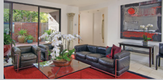
Newly renovated, 4-bedroom/4.5-bath, light-filled 4-level residence in prime location. Family room, south views, landscaped garden, garage.

Steven M. Gothelf 415.345.3063 License# 00709006