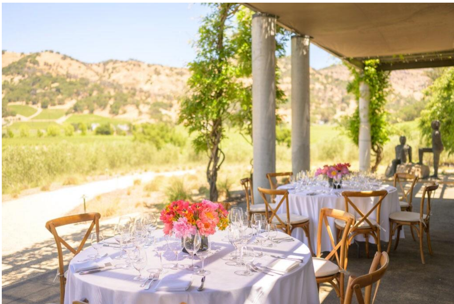
Cliff Lede Diamond Luncheon Experience.