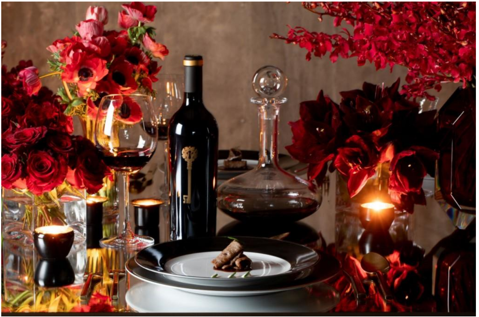
Theorem Vineyards Baccarat Experience.