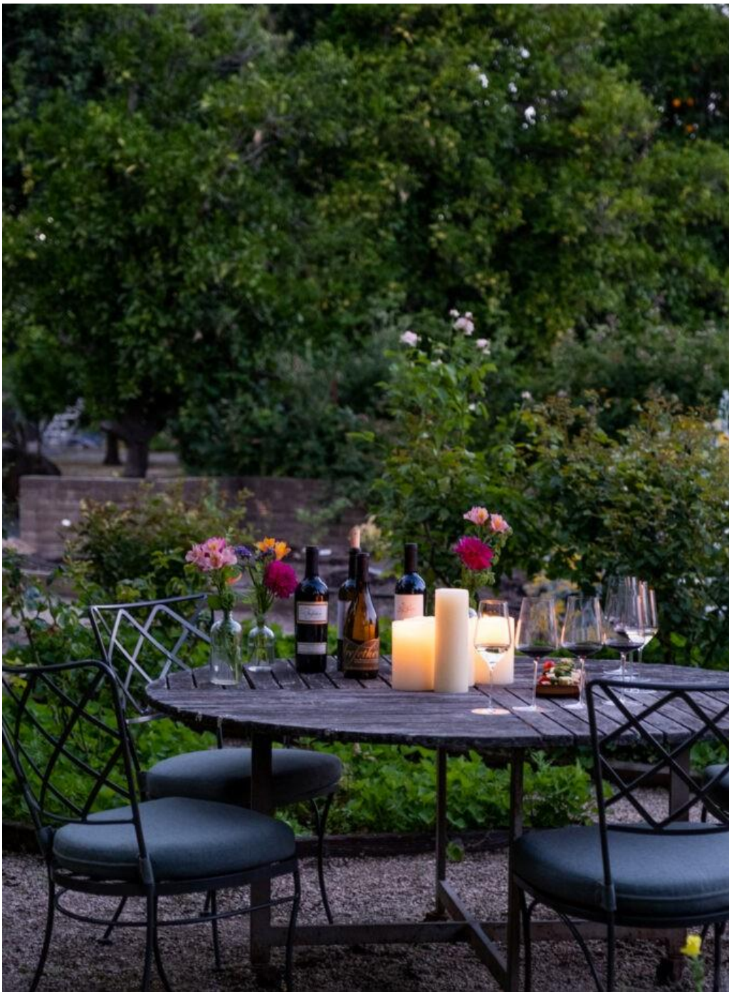
Twilight at Trefethen Experience.