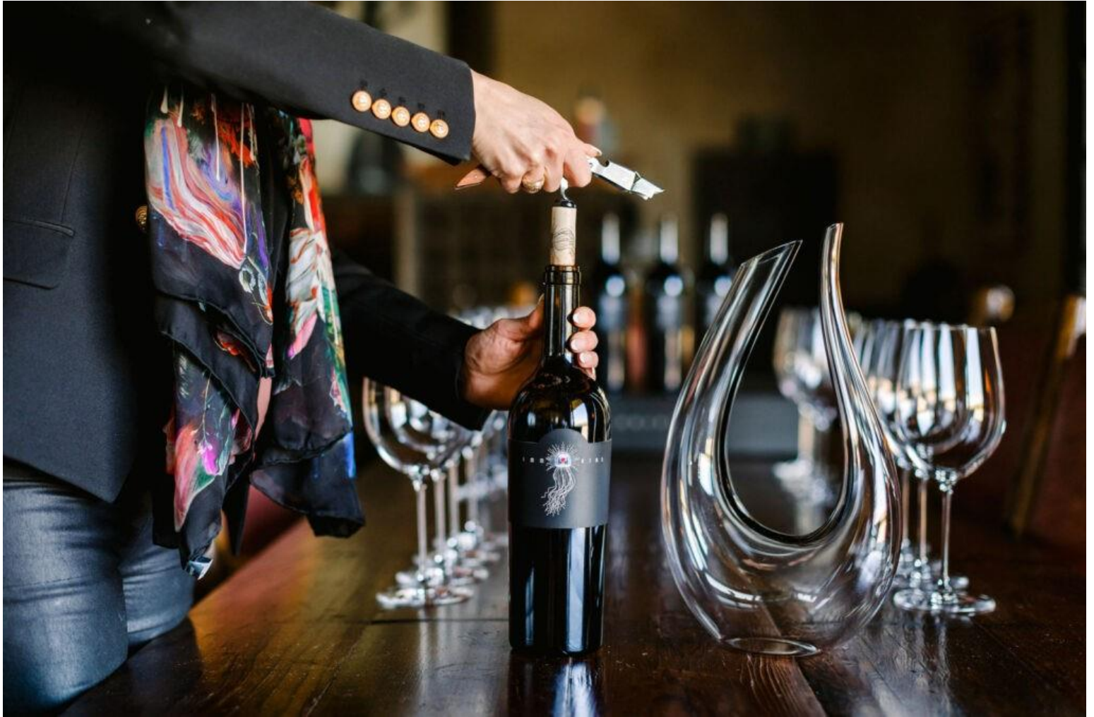
Immortal Estate 100-Point Experience.