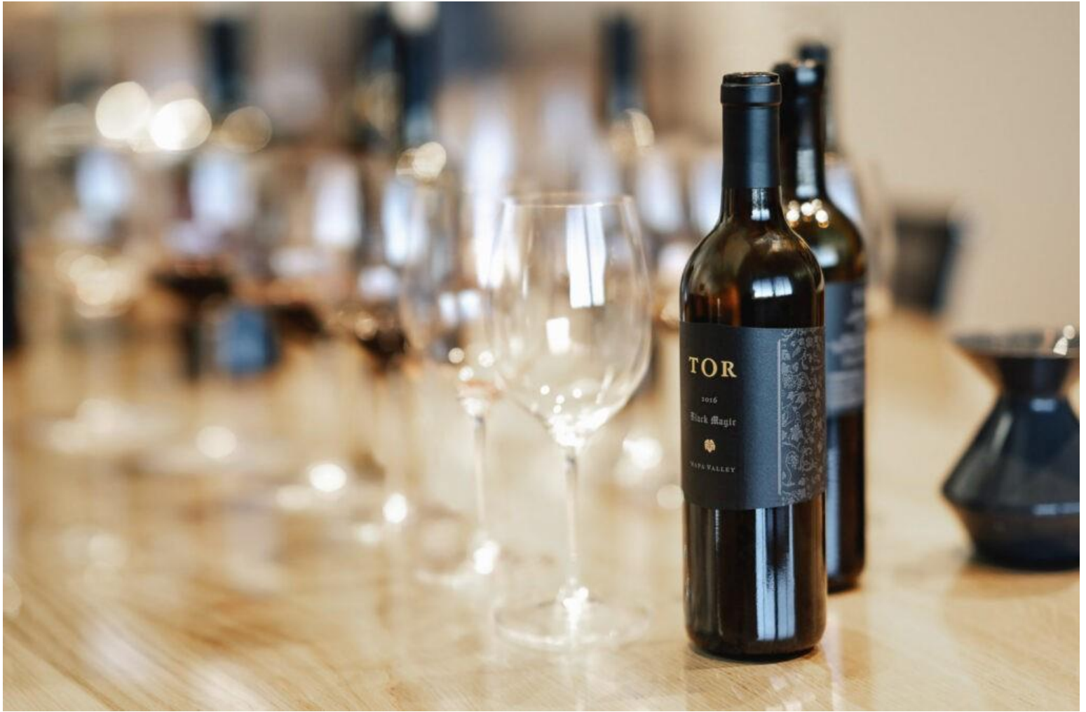
TOR Black Magic Experience.