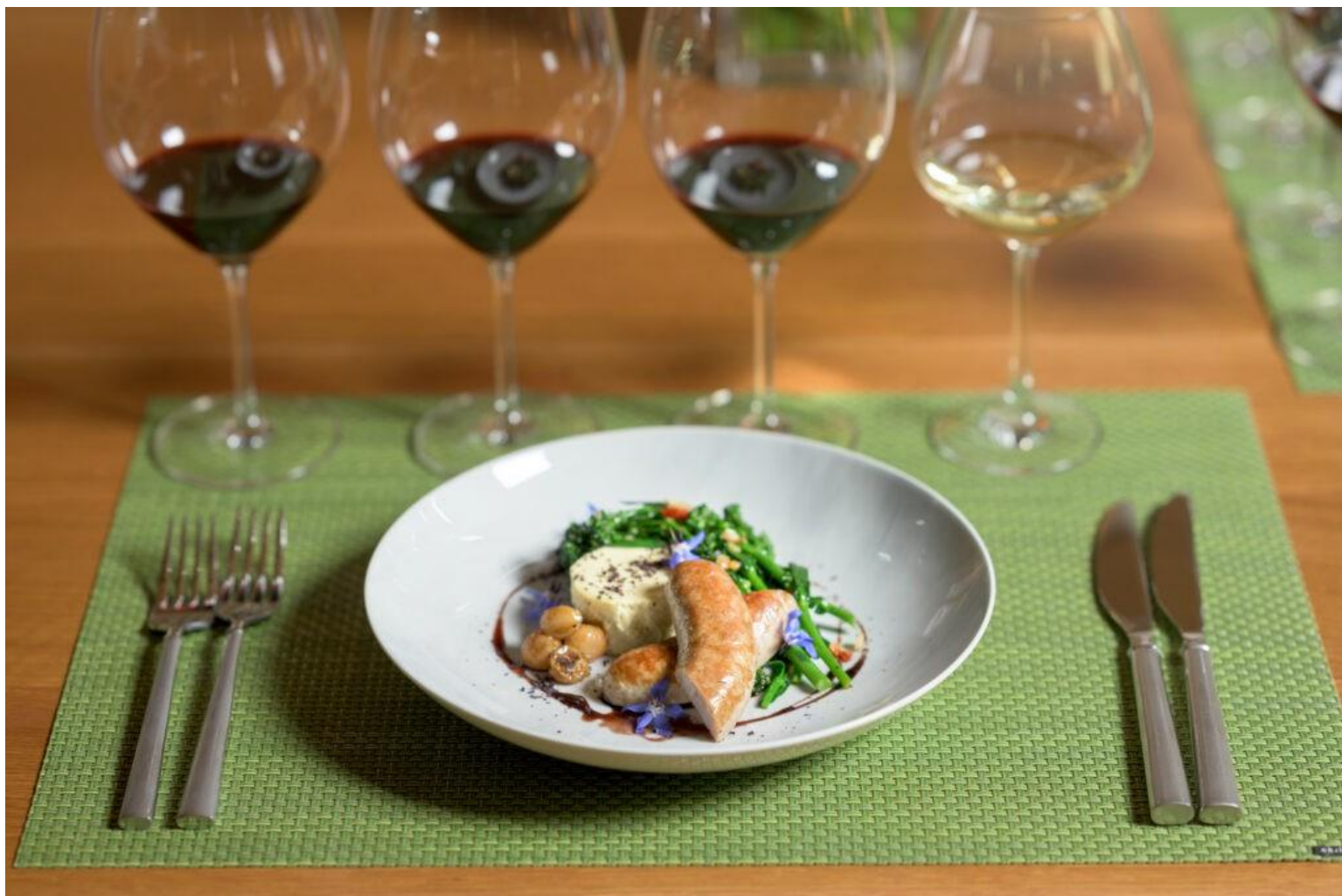
Stag's Leap Wine Cellars Cellarius Kitchen Experience.