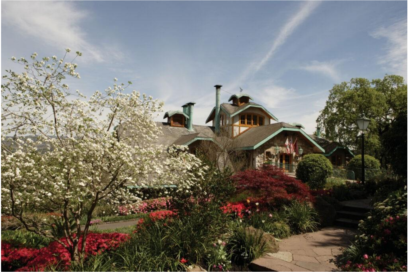
Far Niente Winery.