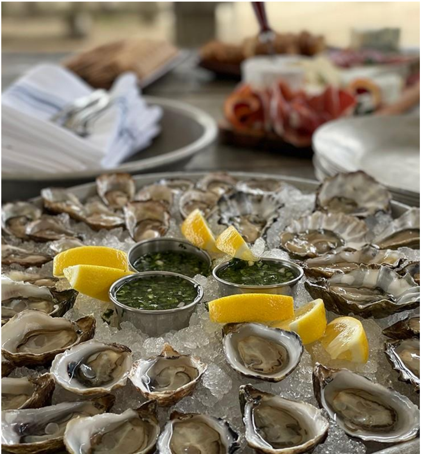
Obsidian Wine Co. Oyster Harvest.