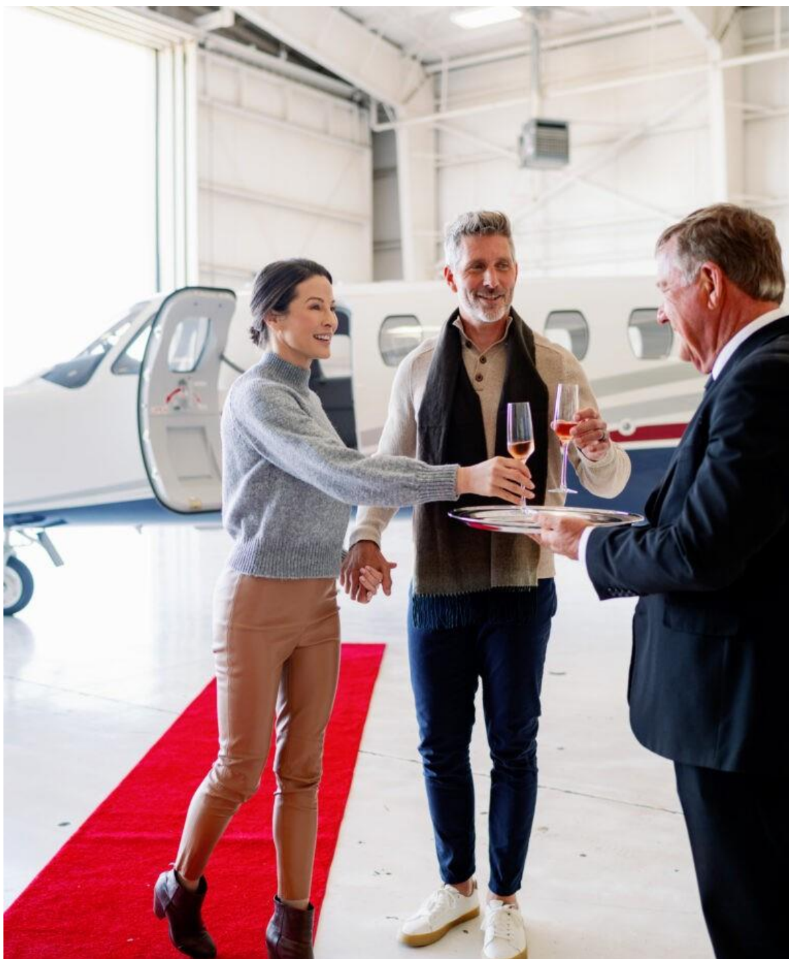
Cultured Vine Bespoke Experiences.