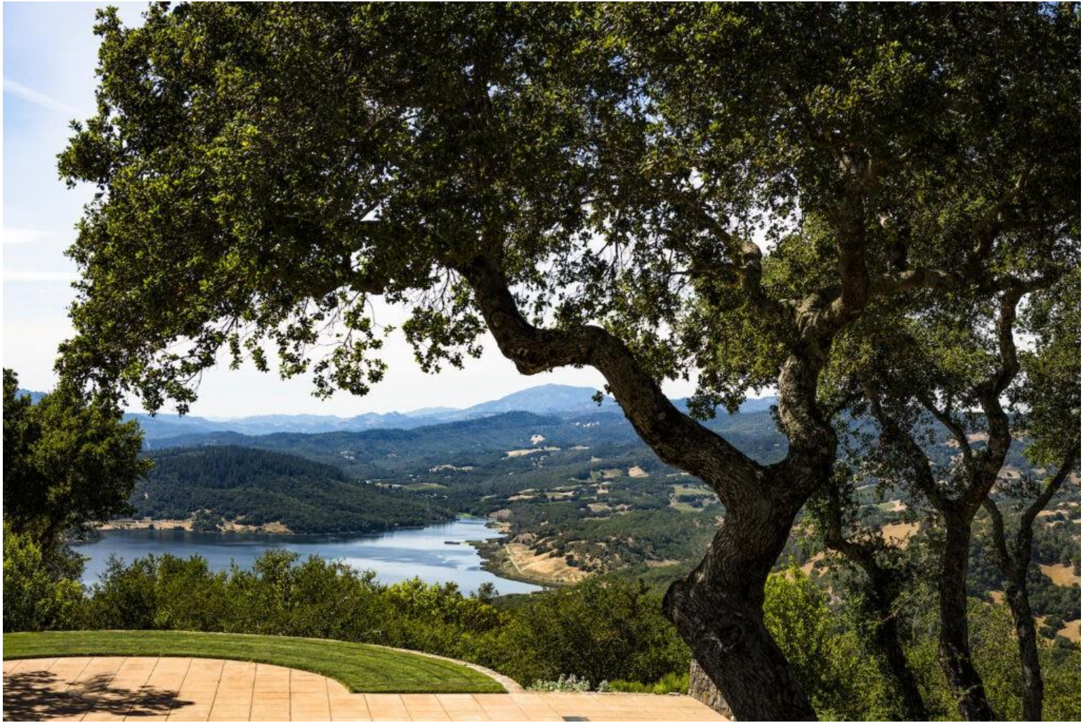
TOR Pritchard Hill Hike.